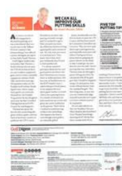
Golf Digest South Africa March 2011