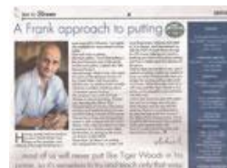
Tee to Green Magazine- March 2011